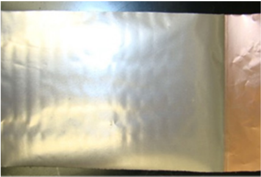
Calendered thin lithium metal film sheet.